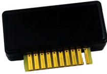
ACCESSORY SOLD SEPARATELY

The DPS PC642C Series surge protective device (SPD) is a two-pair (four wire) module implementing three-stage hybrid technology. This SPD addresses over-voltage transients with gas tubes and silicon avalanche components. In addition, sneak and fault currents are mitigated with resettable fuses (PTCs). The PTCs increase resistance several orders of magnitude when over-currents exceed safe levels. A normal state resumes when over-currents are removed. The ability to self-restore in this manner significantly increases suppressor performance and survivability.