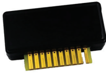
ACCESSORY SOLD SEPARATELY

The DPS PC642C Series surge protective device (SPD) is a two-pair (four wire) module implementing three-stage hybrid technology. This SPD addresses over-voltage transients with gas tubes and silicon avalanche components. In addition, sneak and fault currents are mitigated with resettable fuses (PTCs). The PTCs increase resistance several orders of magnitude when over-currents exceed safe levels. A normal state resumes when over-currents are removed. The ability to self-restore in this manner significantly increases suppressor performance and survivability.