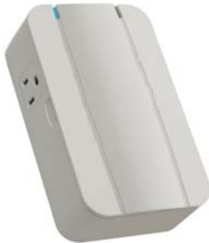
ACCESSORY SOLD SEPARATELY

The PMD2 series wall mount suppressor is designed to protect 120 volt electronics with up to 15 amps current carrying capability. PMD2 has outlets on the sides (90 degree angle from one another) to accommodate a variety of plugs.