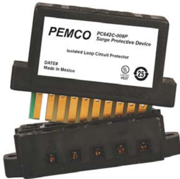
ACCESSORY SOLD SEPARATELY

The DPS PC642C Series surge protective device (SPD) is a two-pair (four wire) module implementing three-stage hybrid technology. This SPD addresses over-voltage transients with gas tubes and silicon avalanche components. In addition, sneak and fault currents are mitigated with resettable fuses (PTCs). The PTCs increase resistance several orders of magnitude when over-currents exceed safe levels. A normal state resumes when over-currents are removed. The ability to self-restore in this manner significantly increases suppressor performance and survivability.